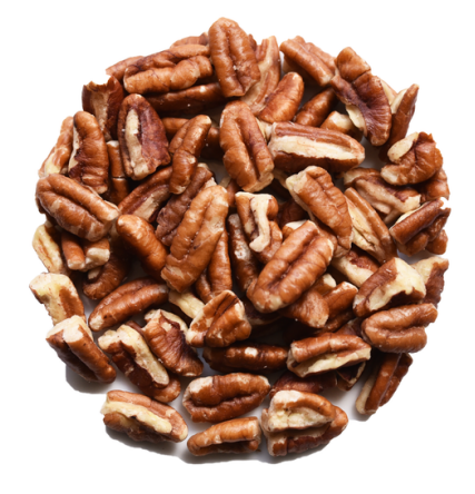
<u>MEDIUM PIECES</u> Code: 4 24/64" - 16/64" (3/8"-1/4")