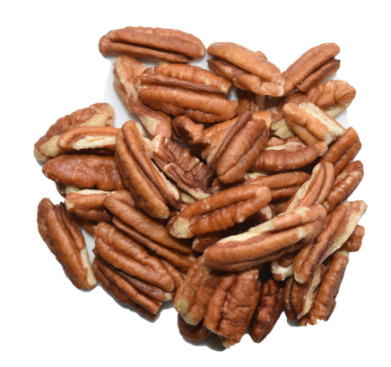
LARGE PIECES Code: 7 32/64" - 24/64" (71/2" - 3/8")

EXTRA LARGE PIECES Code: 17 No limitation 32/64" (No limitation - 1/2")